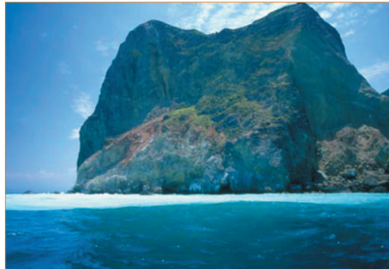
Figure 1 Kueishan Island. Sulphur particles are seen on the sea surface as a whitish area; the density of these particles varies with the number of chimneys under the sea and the prevailing wave and current conditions.

Almost nothing is known about the ecology of Xenograpsus crabs. The species X. novaeinsularis has been observed feeding on the ocean floor using its setae-tipped pincers 7 but its diet is not known. At Kueishan, X. testudinatus congregates in large numbers in vent crevices 6,8 (at an average density of 364 crabs per square metre; Fig. 2a, and see supplementary information), and the question arises as to how this ecosystem can